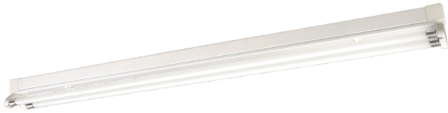
TMS T5 Luminaire