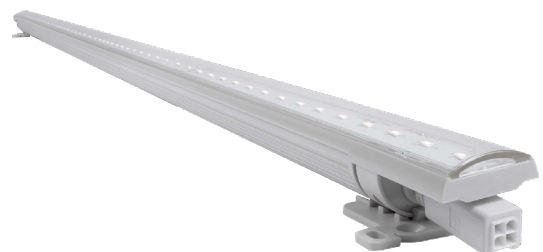
Cove Lighting Luminaire