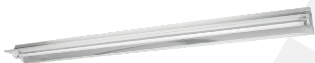
Batten Luminaire with IP65 Lamp holders