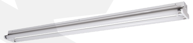
TMS T8 Luminaire