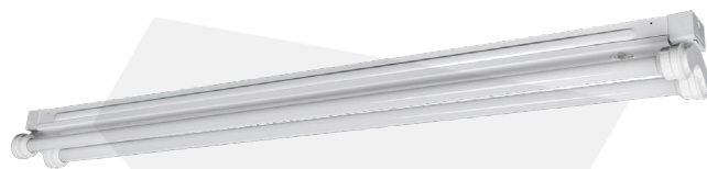
Batten Luminaire with IP65 Lamp holders