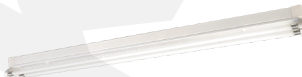
Batten Luminaire with IP65 Lamp holders