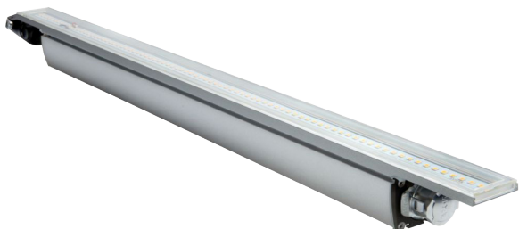
Cove Lighting Luminaire