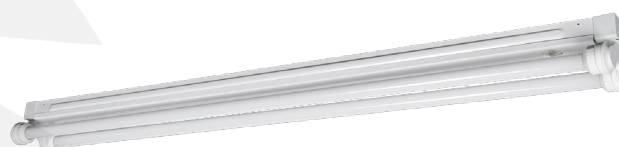
Fibreglass Luminaires with IP65 Lamp holders