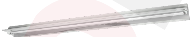
Fibreglass Luminaires with IP65 Lamp holders