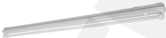
Fibreglass Luminaires with IP65 Lamp holders