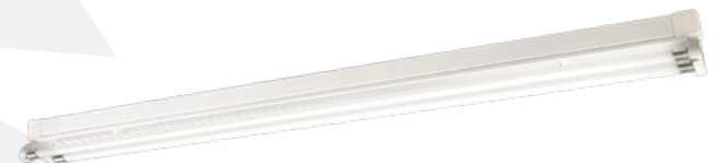
TMS T8 Luminaire