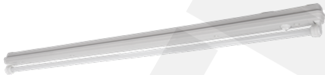
TMS T8 Luminaire